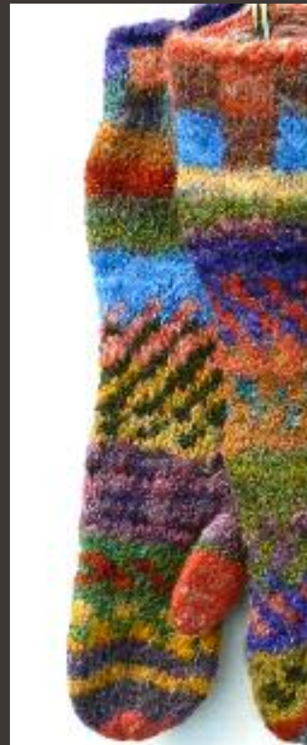
GAUNTLET PATTERN AVAILABLE