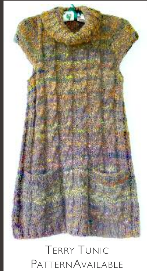
TERRY TUNIC PATTERN AVAILABLE