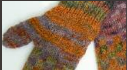
FAIR ISLE MITTS