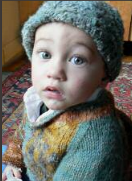
CHAYCE CLASSIC SWEATER

Sweaters, socks, mittens, gauntlets, and scarves are also part of the Crayonbox line. Below are unique items and prototypes. Special orders are always welcome. Please feel free to contact Carol for specific details and availability at crayonbox@frontiernet.net